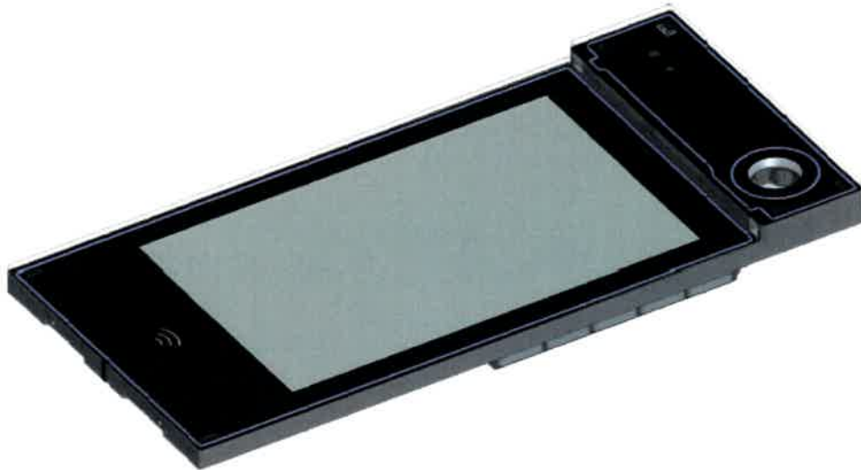
Fig. 1 Assessed product – front side

The protection degree provided by enclosures (IK code) was assessed on product Intercom, type designation 2N® IP Style, Order number 9157xxx.