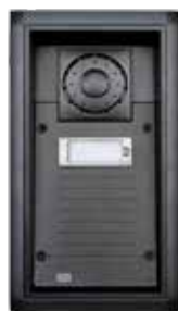
2N® Analog Force

Using the services of the existing analog exchange not only saves costs on a new solution, but also offers a better quality and wider range of services, e.g. out-of-office redirect (to another office, voicemail, etc.) or putting a call through (e.g. from the secretariat to a particular person).