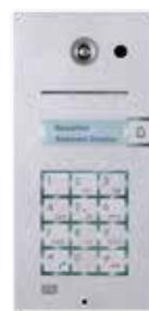
2N® Analog Vario