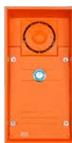
2N® Analog Safety