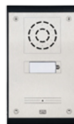
2N® Analog Uni